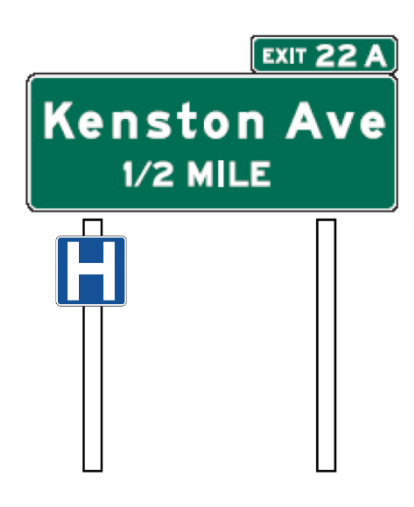
1/2 Mile Assembly